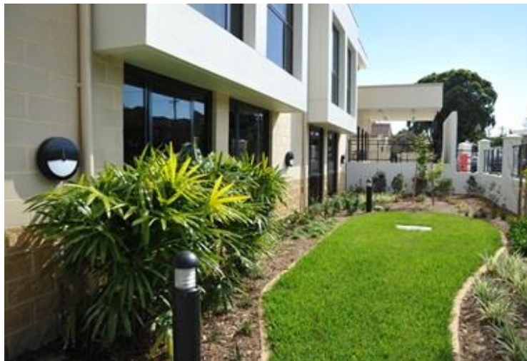
Landscaped Gardens Surrounding the Centre