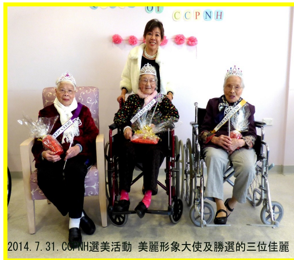
2014. 7. 31. CCPNH選美活動 美麗形象大使及勝選的三位佳麗