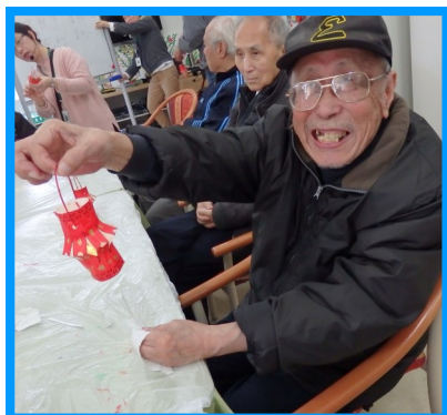
So Wai clients enjoy a game of putt putt golf whilst others make lanterns in celebration of the August Moon Festival.