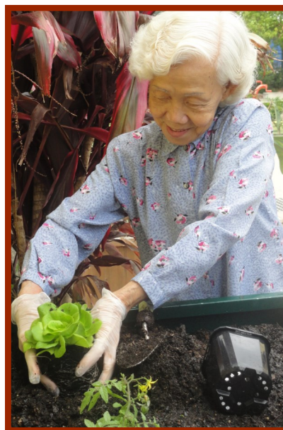
Spring time offers some time for planting and outdoor gardening.