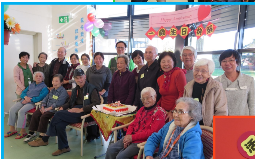
Hurstville Respite Day Care Centre celebrates its First Birthday along with smiling and happy faces.

Celebration of activities at Hurstville Respite Day Care Centre.