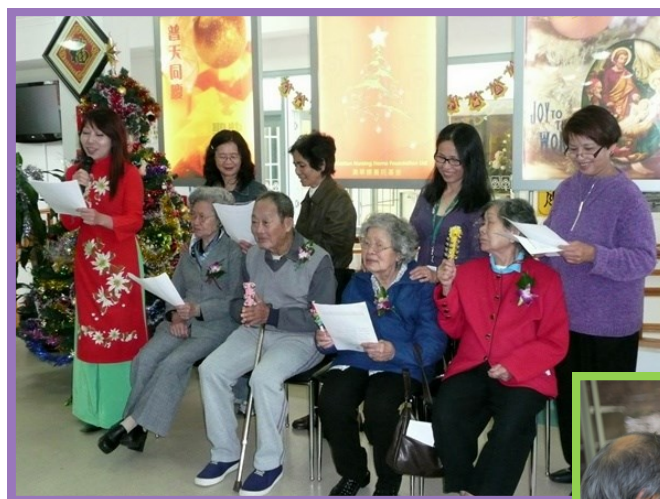
So Wai Vietnamese group sing in unison.