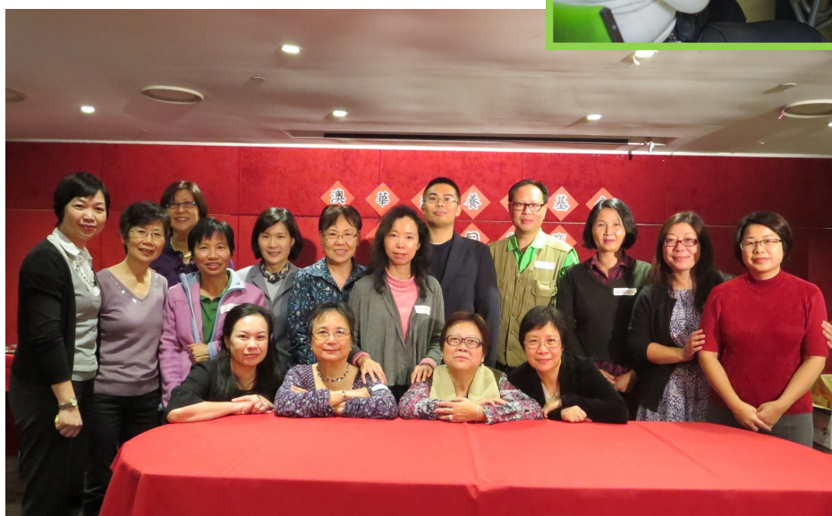
The robust team of ANHF volunteers at the annual Volunteer Appreciation Night.