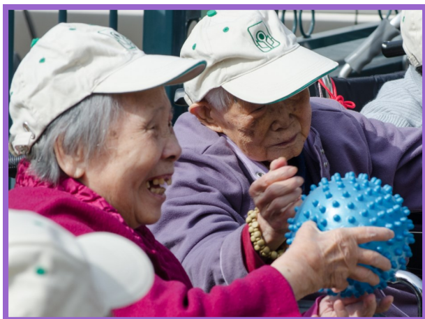
Residents of Bernard Chan enjoyed some outdoor activities with the in-house Recreational Activities Officer.