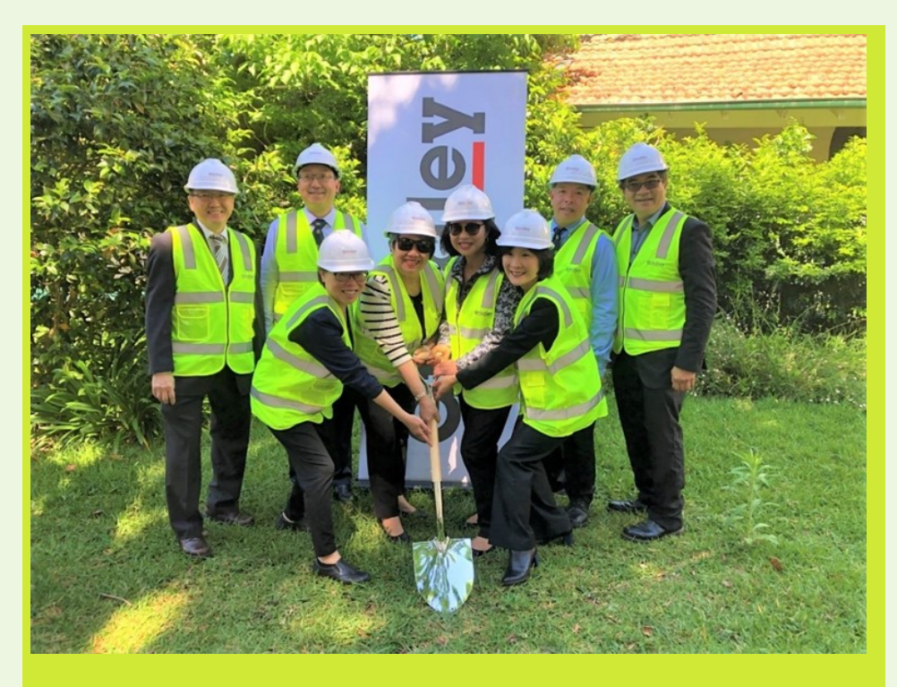
With concerted efforts and a united spirit among the Board and each and every staff, the new nursing home should have been completed by mid 2022.

Grindley, the project contractor, is a construction company that has constructed many famous, awardwinning nursing homes. Prior to the Earth Breaking Ceremony, Grindley planned an Adopt a Plant Day for ANHF. Flyers were distributed to invite neighbours to receive a free plant removed from the construction site for re-planting in their own home. Nearly 20 neighbours supported this meaningful act.