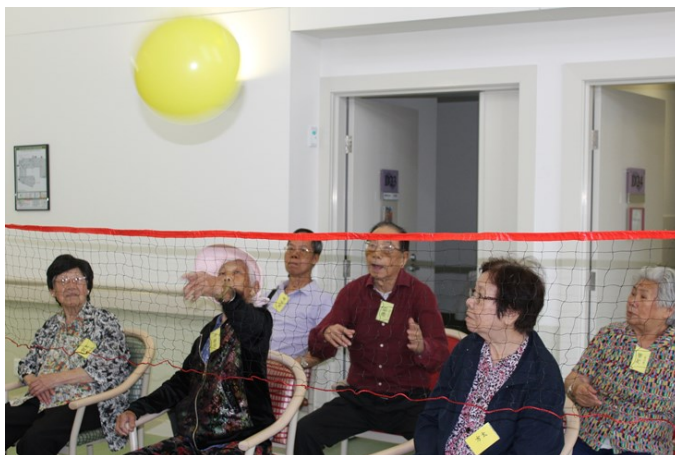
Concentrating in the balloon volleyball game 全情投入「氣球排球」