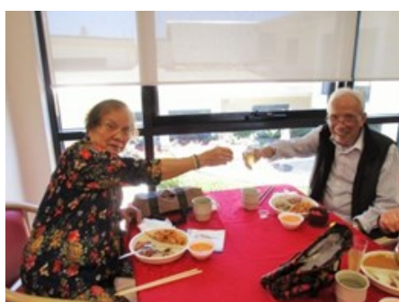
Merry Christmas to everybody!