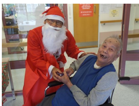
Sharing the joy of Christmas!