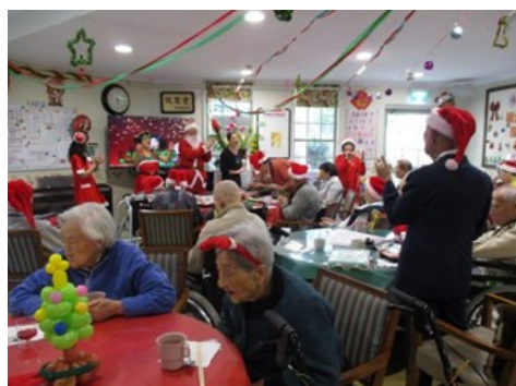
Colourful streamers, happy mood