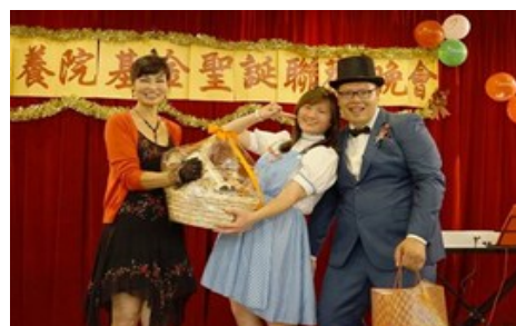
Winners of the best dressed cosplay contest