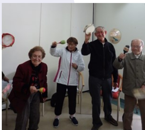
Music Fun 音樂、快樂