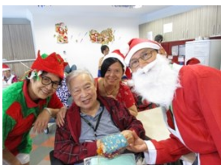
May our laughter brings joy and health!