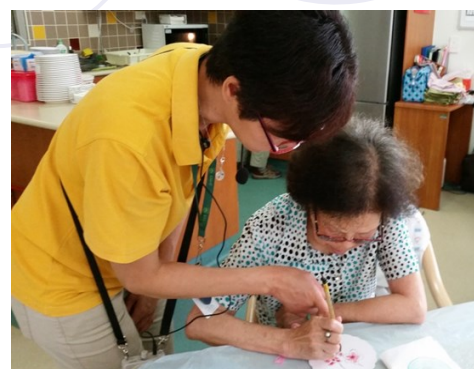
Painting my own fancy fan 親手描繪屬於我的扇面