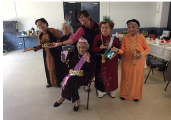
Beauty queens from our Vietnamese group 來自越南組的可人兒 --越南組選美大賽