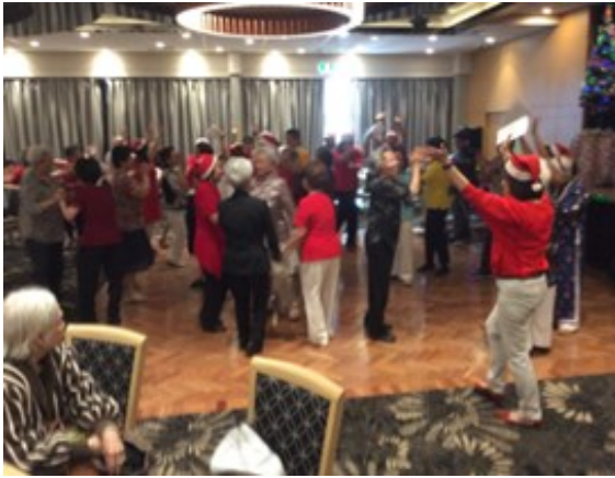
Put on your dance shoes for our Xmas party 穿上舞鞋參加我們的聖誕派對！