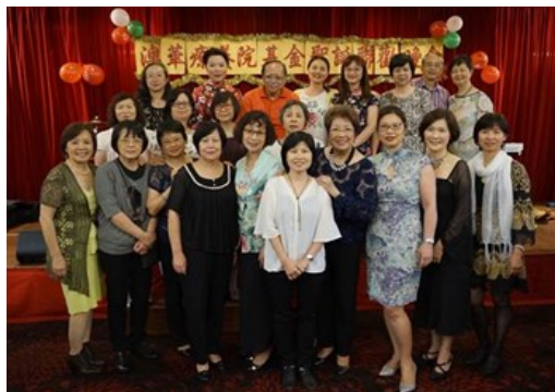
A group photo to kick off the night