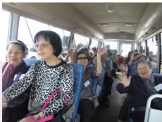
Cheerful seniors inside our community bus 長者們已經心情大好---好戲還未上演呢！