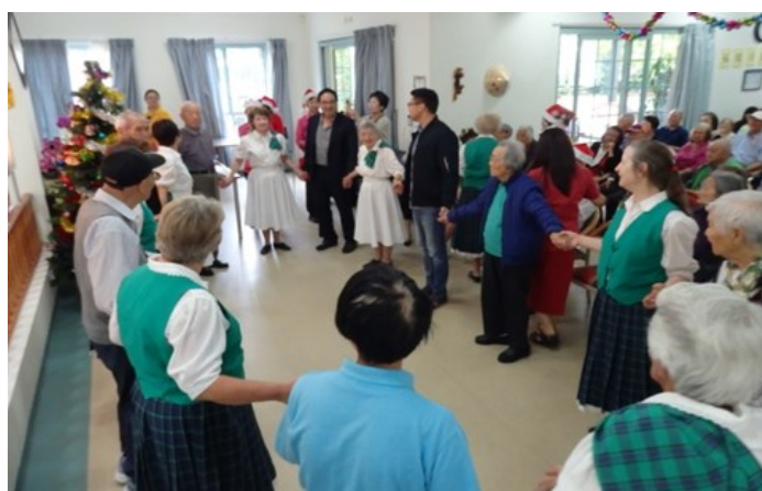
Shall we dance – a Scottish dance? 要不要來一個……蘇格蘭舞？