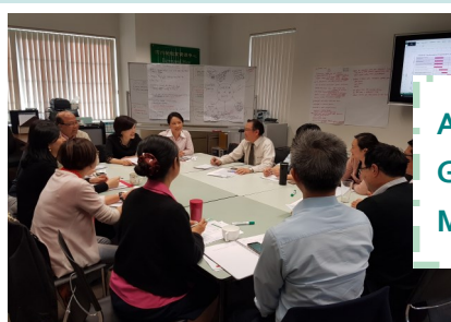
ALPHA GROUP MEETING

prioritise key areas for development which will support the accomplishment of the organisation goals and repositioning of organisational cultural values. A shortlist of ideas / recommendations was identified as a catalyst to inspire cultural change within our organization, to grow and transform our organisational values and care philosophies. The discussion led to us to redefine the ANHF consumer value proposition “We value you and care for you like a family” – a statement that represents ANHF organisation’s commitment to define a unique customer