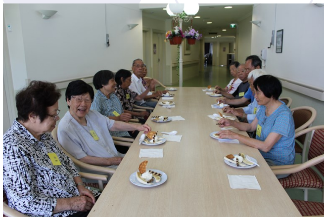
Enjoying 'banana boats' for afternoon tea in hot weather 長者們享用香蕉船下午茶驅散熱浪