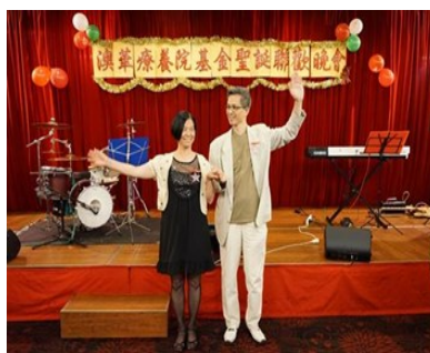
Two of the finalists of the night