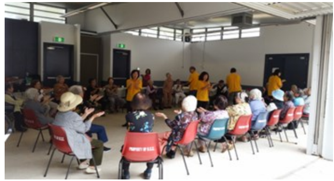
Chinese and Vietnamese clients stretching their limbs in a combined exercise session