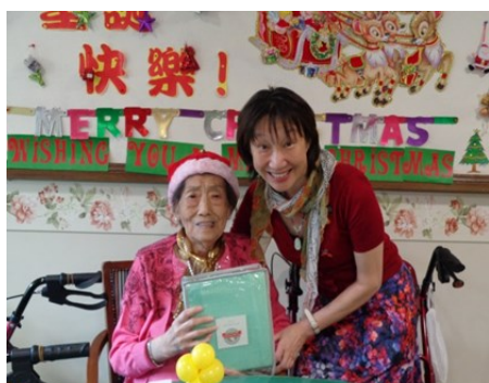
My Christmas present!