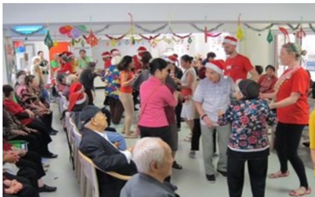
Who dares say we are too old for dancing? 誰敢說老太太的骨頭硬，跳不來舞？