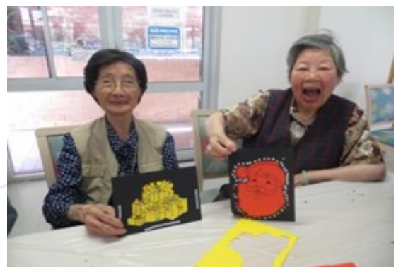
I made it! 我自己做的！