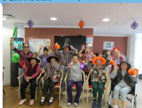
萬聖節扮鬼扮馬，我們的長者都是影帝影后！ Our best actors and best actresses in Halloween Day. (錢梁秀容療養院 LCACC)