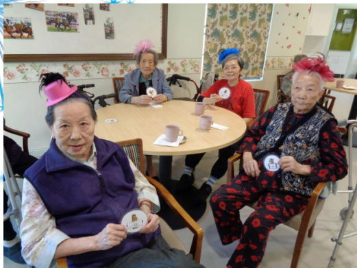
長者隆重裝扮一起參與墨爾本杯 A good reason to dress up – Melbourne Cup (陳秉達療養院 BCNH)