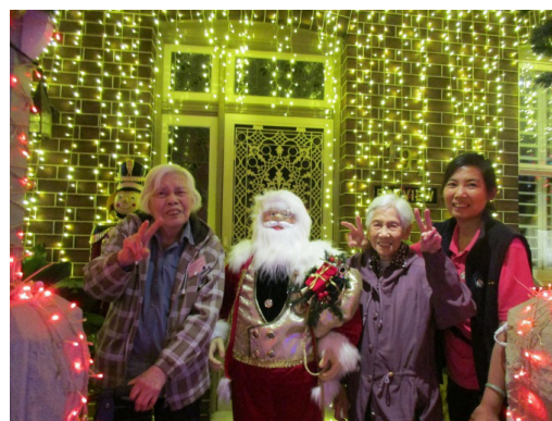
帶長者欣賞聖誕燈飾，過一個難忘的聖誕！ A visit to spectacular Christmas lighting lit up our Christmas memories. (錢梁秀容療養院 LCACC)