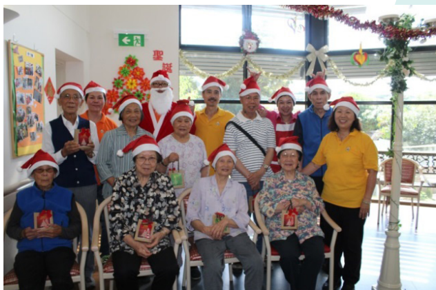
聖誕節怎少得聖誕老人派禮物! How could a Christmas party be without Santa?!