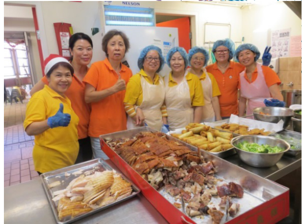
派對的幕後功臣，看他們泡製的聖誕大餐多豐盛! Unsung heroes of the Christmas party – couldnt have taken our eyes off the array of great food! (沛德活動中心 SHSWC)