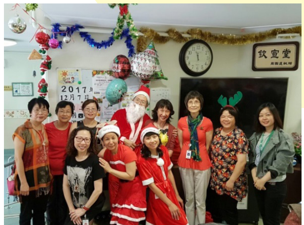
聖誕老人來到陳秉達療養院大派禮物! Santa Claus came to Bernard Chan Nursing Home with his many presents.