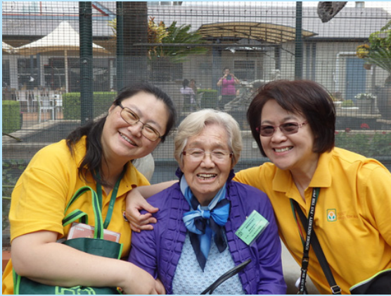
每個燦爛的笑容都可證明長者外遊多開心! Happy were those who were in an outing. Their broad smiles painted a thousand words. (蘇懷活動中心 SWSWC)