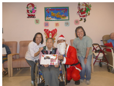
聖誕節有家人和聖誕老人相伴，夫復何求！ What could have been better than being with our family members and Santa Claus at Christmas time! (周藻泮療養院CCPNH)