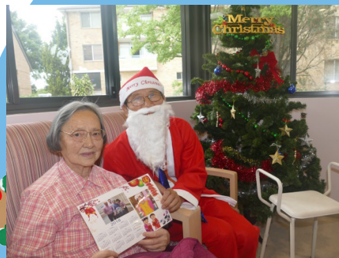
聖誕送暖，關心每位長者，才是聖誕真義！ Tender loving care for our elderly residents – the real essence of Christmas! (周藻泮療養院CCPNH)