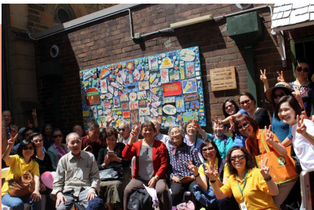
長者親手拼製的馬賽克壁畫於歐田磨續紛外城節揭幕 Unveiling of the mosaic wall painting by our elderly clients at Ultimo Uptown Festival. (沛德活動中心 SHSWC)