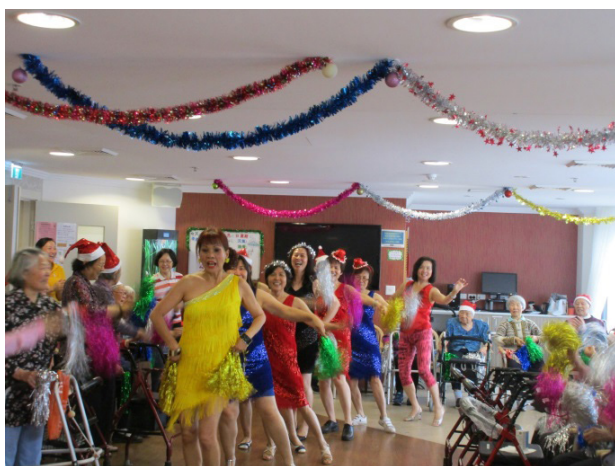
在跳舞老師帶領下職員和長者一起跳舞，這個聖誕 真開心！ Dance! Dance ! Dance! What a merry Christmas it was to dance with the instructor and the staff! (錢梁秀容療養院 LCACC)