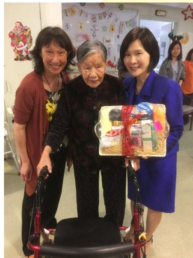
長者抽到聖誕大獎多開心! Grinning from ear to ear – Christmas pressies!!! (陳秉達療養院 BCNH)