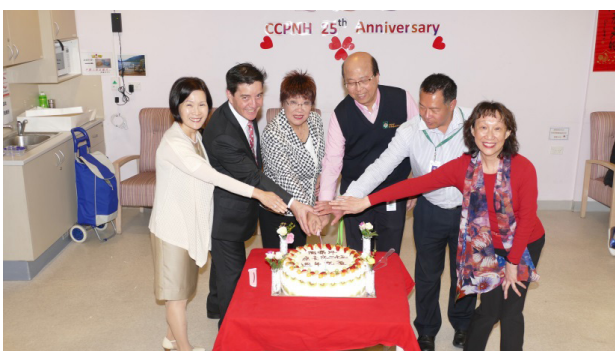
周藻泮療養院25週年生日快樂！ HAPPY 25th anniversary to Chow Cho Poon Nursing Home! (周藻泮療養院CCPNH)