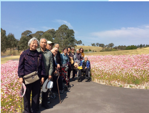
在一遍花海下合照，爭妍鬥麗! What is more eye-catching – our elderly clients or the sea of flowers? (綠田園活動中心 GPSWC)