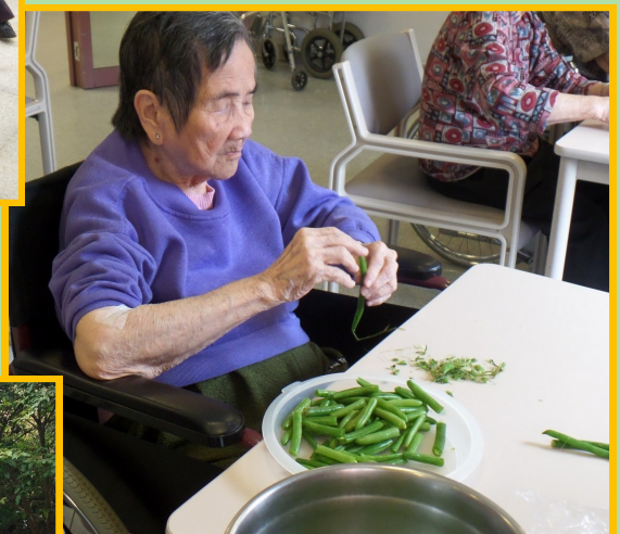
Above: Chow Cho Poon Nursing Home's resident is busily shelling beans for dinner.