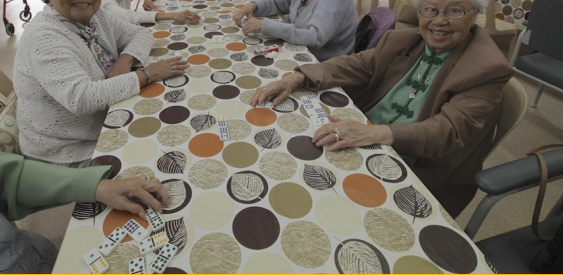
Above: Clients at Greenfield Park play a game of dominoes.