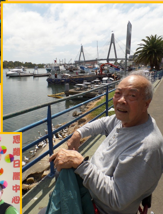
Above: A Day Care Centre client visit the fresh fish at the Fish Markets.