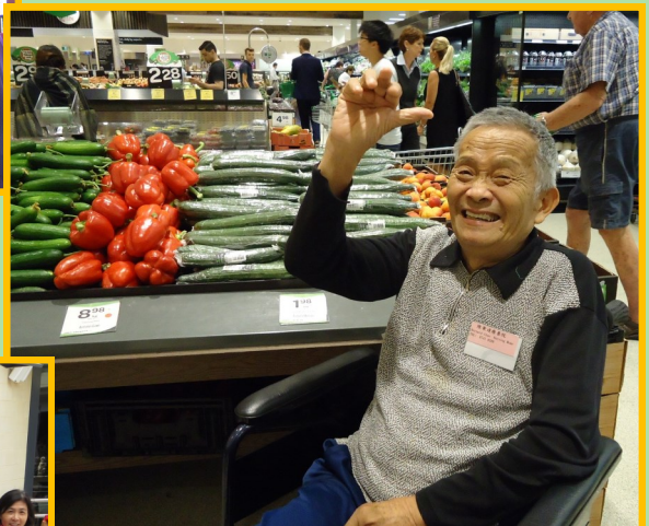
Above: Bernard Chan Nursing Home's resident savvy shopper.