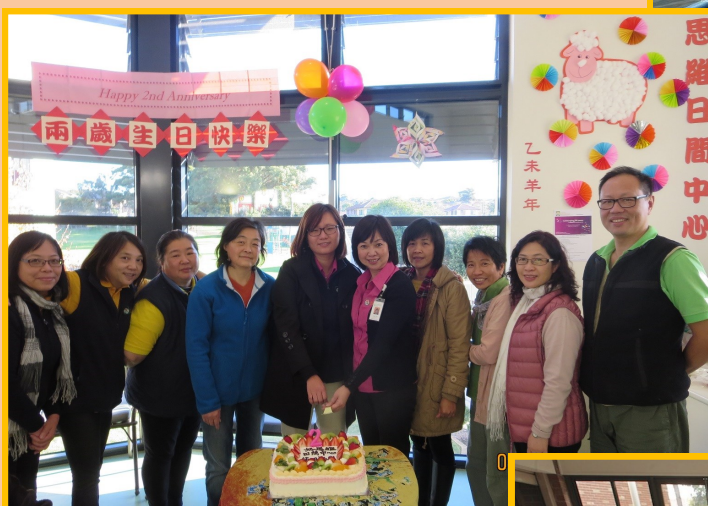
Above: Hurstville Day Respite Care Centre celebrated their 2nd birthday—Happy Birthday!