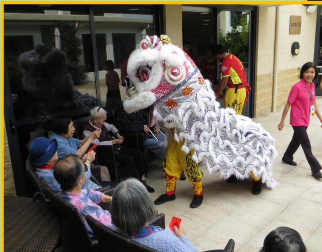
Above: Good health and fortune brought to Lucy Chieng Aged Care Centre.