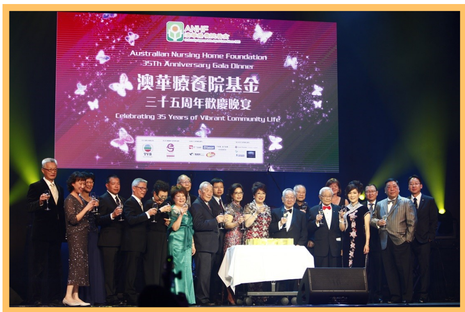
Above: ANHF Patrons, Trustees, Board Members and Senior Management in the toasting ceremony.

ANHf marked 35 years of culturally appropriate aged care services by celebrating at The Star Event Centre, Pyrmont on 30 August 2015. The night of celebrations was truly memorable with over 700 guests attending the gala dinner.