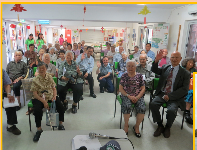
Left: Stanley Hunt Centre were informed by a talk on Crime Prevention with great attendance.