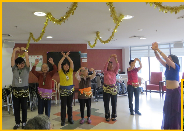
Left: Belly dancing is so much fun at Lucy Chieng Aged Care Centre.