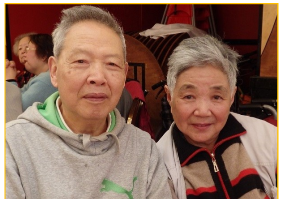
Above: Our seniors enjoyed the august moon festival luncheon with their family members.

Although we have the luncheon each year, the bright smiles of our elderly clients and the contentment of the carers strike a clear note: that is worth all our efforts.