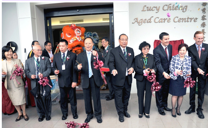
Ribbon-cutting by trustees and VIPs 基金會信託人聯同嘉賓一同剪綵