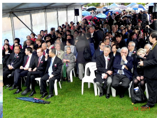
The huge marquee was guest-packed despite the heavy rain. 儘管大雨滂沱，嘉賓仍坐滿整個帳篷， 傳媒爭相報導此項華人社區盛事