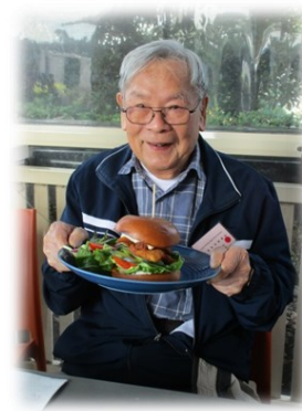
誰說長者入療養院就吃不到漢堡包! Another choice for our residents: hamburgers (錢梁秀容療養院 LCACC)