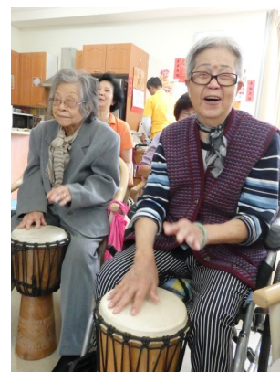
打鼓有多開心，看長者的笑臉就知道！ 'Drums' up for our drumming skills! (蘇懷活動中心 SWSWC)