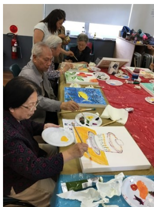
齊心就事成，長者齊來開畫展! Unity is might. We'll soon have our joint exhibition!