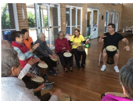
看我們的長者打鼓打得多豪邁奔放! Endless energy came with the rolling of drums! (西南悉尼活動中心 SWSSWC)