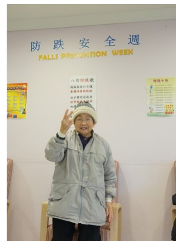
防跌安全週，長者齊參與。 Falls Prevention Week – interesting activities for everybody (周藻洋療養院 CCPNH)