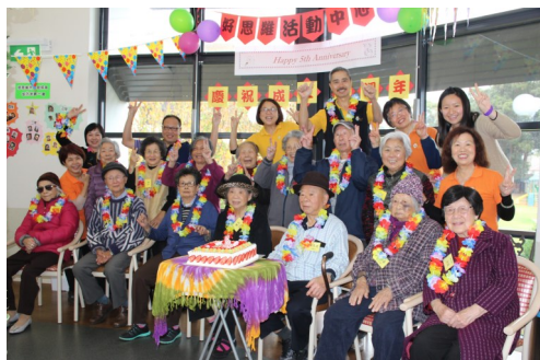
好思維活動中心五週年生日快樂! Happy 5th anniversary to Hurstville Seniors Wellness Centre (好思維活動中心 HSWC)