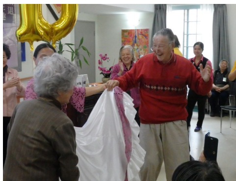
咪笑我地老，跳舞比年青人還好! The more we age, the better we dance! (蘇懷活動中心 SWSWC)