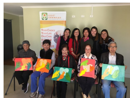
在畫師指導下，讓長者畫出心中彩虹。 Painting the rainbows in our hearts. (家居服務 HCS)