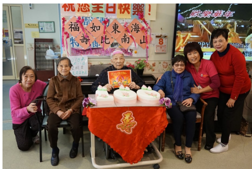
祝百歲婆婆福如東海，壽比南山! Blessings and well wishes to a happy centenarian! (陳秉達療養院 BCNH)