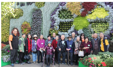
看花漂亮還是我們的長者漂亮! A beauty contest between flowers and our elderly clients! (好思維活動中心 HSWC)