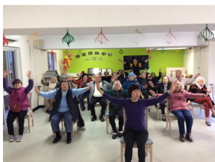
坐著也可以做大極，多開心！ Chair tai chi – here's how it goes! (沛德活動中心 SHSWC)