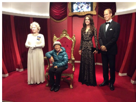
長者參觀悉尼杜莎夫人蠟像館，和皇室人員合照！ Visit to Tussaud Wax Museum – taking photos with the royal family! (沛德活動中心 SHSWC)