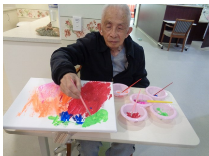
彩色斑斕，我們長者多有大畫家風範！ Dashes of vibrant colours under the hands of the master painter! (陳秉達療養院 BCNH)