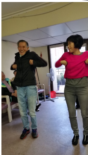
愛笑瑜珈，讓長者開懷大笑！ Laughter yoga that brings smiles to everyone! (社區房屋 Community Housing)