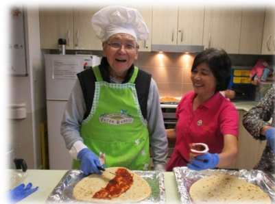
廚神出馬，大家有口福！ Mouth-watering food prepared by our master chefs! (錢梁秀容療養院 LCACC)