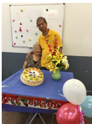
有我們充滿愛心的職員相伴，這個生日過得特別快樂！ What a HAPPY birthday with staff who cared! (西南悉尼活動中心 SWSSWC)