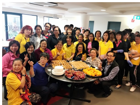
行政總裁和家居服務員工同慶母親節。 Our CEO and our home care team celebrated Mother's Day together. (家居服務 HCS)