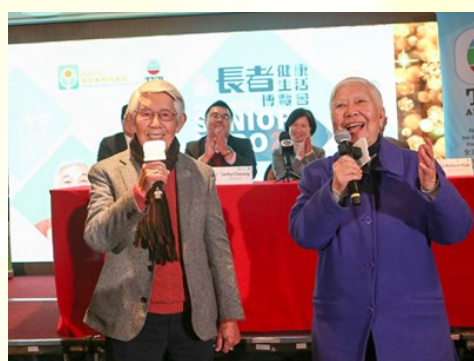
'Grandpa' and 'Grand Auntie' from Living Longer Living Better Series were at the press release to promote the event.