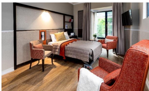
Single Room with Shared En-suite