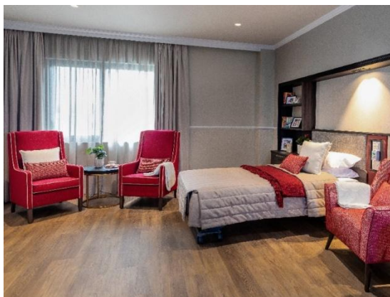
Large Single Room with Private En-suite (the largest room in the facility – only one such room)