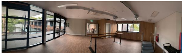
Central ground floor courtyard to Heritage Cottage / Club House