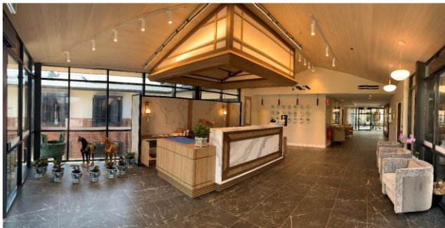
Reception Area / Lift Foyer