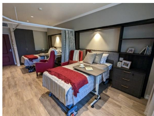
Double Room with Shared En-suite