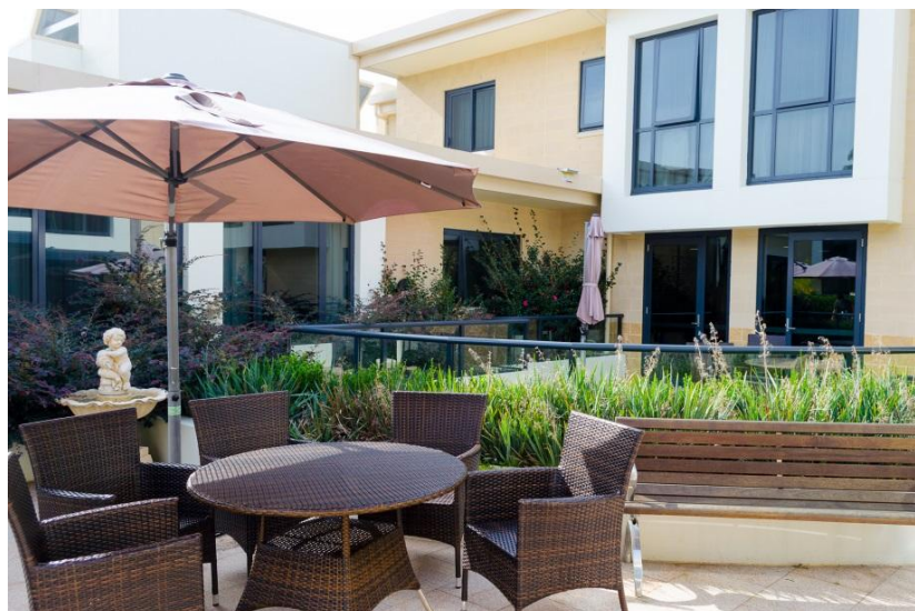
Internal Courtyard and Al Fresco Area