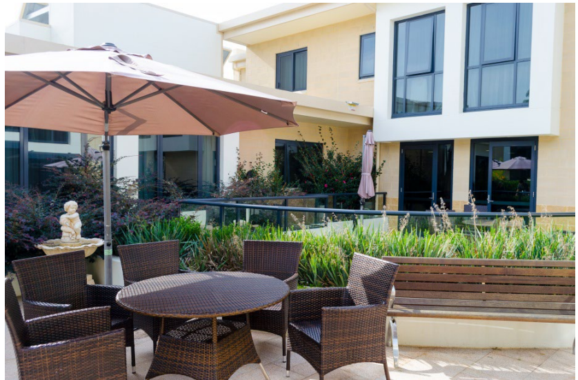
Internal Courtyard and Al Fresco Area