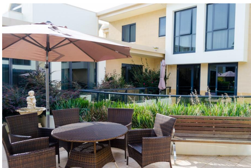
Internal Courtyard and Al Fresco Area