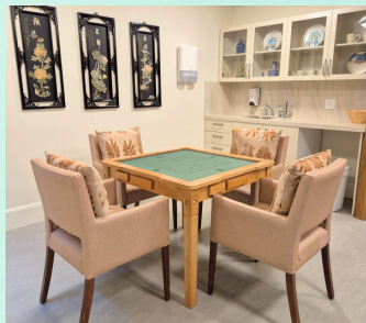
MULTI-PURPOSE ACTIVITY ROOM

The facility includes nursing stations, therapy rooms, a library, gym, relaxing gardens, a beauty salon, and multifunctional leisure facilities. Nutritious meals blending Chinese and Western cuisine are offered, where residents can enjoy the warmth and comfort of home.